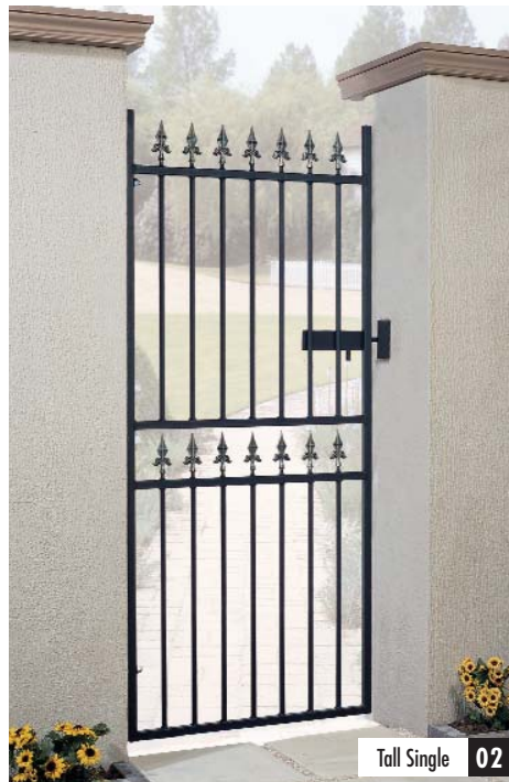
02 Castle Tall Single