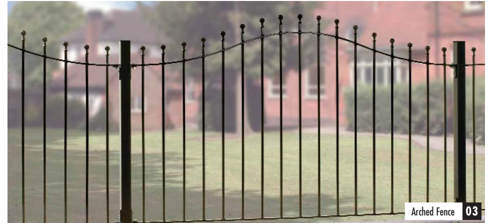
03 Viking Arched Fence