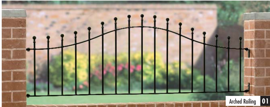
01 Viking Arched Railing

Supplied with fittings pack for screw fixing to brick/timber or a range of metal posts. Panels can be fixed to metal posts using the self-tapping screws supplied with the posts. Height dimension is taken to the highest point.