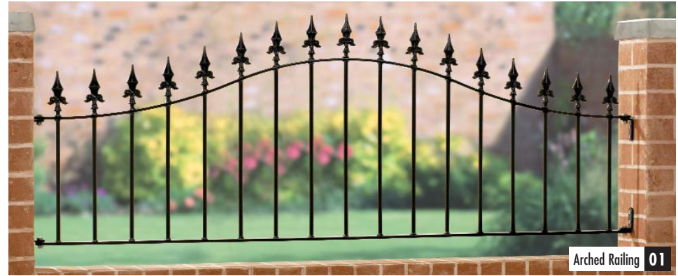
Arched Railing 01

Supplied with fittings pack for screw fixing to brick/timber or a range of metal posts. Panels can be fixed to metal posts using the self-tapping screws supplied with the posts. Height dimension is taken to the highest point.