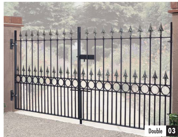
03 Fortress Double