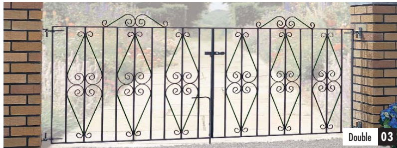
03 Watling Double