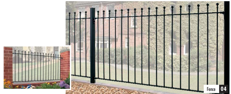
04 Viking Fence