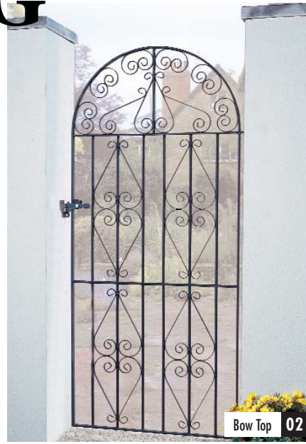
02 Watling Bow Top