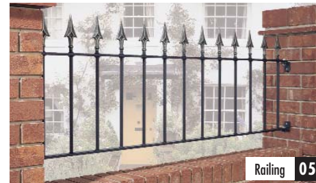
05 Fortress Railing

All Fortress gates have the closing bolt on the right hand side when viewed from the road, as illustrated.