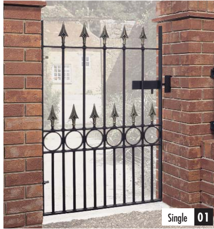
01 Fortress Single

Solid steel construction 16mm diameter infill bars Heavy duty 40mm x 10mm frames Tall Double gates hanging stiles 40mm x 30mm