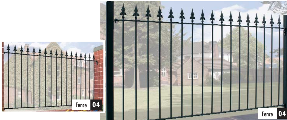
04 Roman Fence