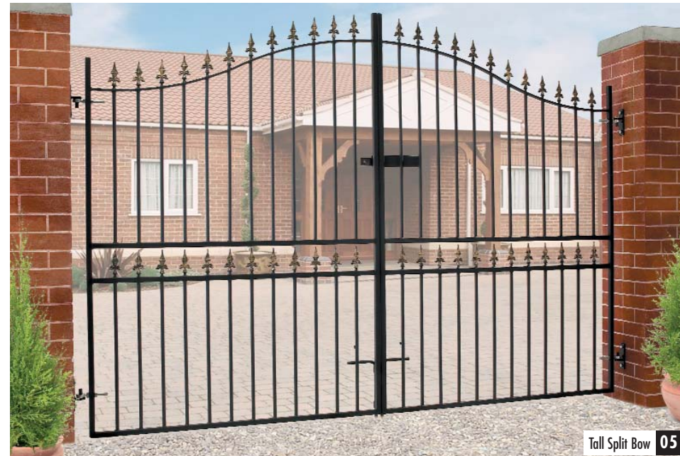
Tall Split Bow 05