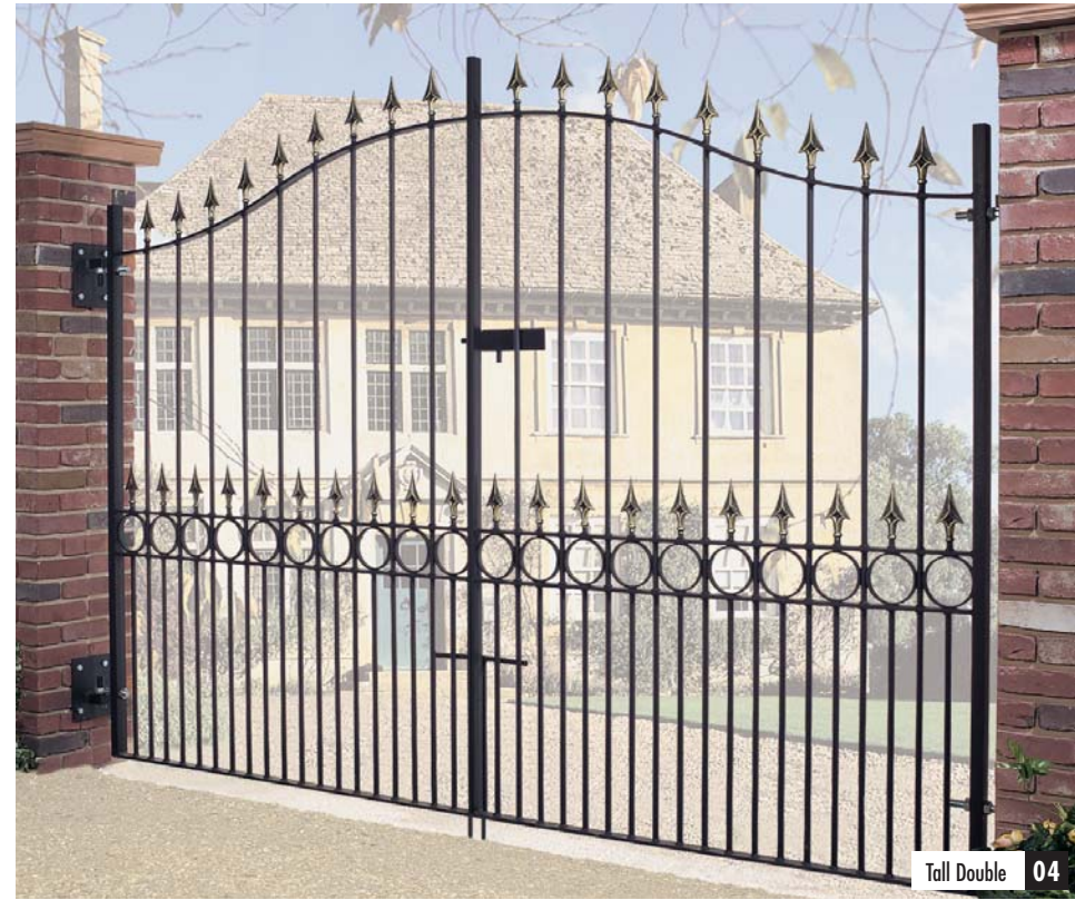
04 Fortress Tall Double