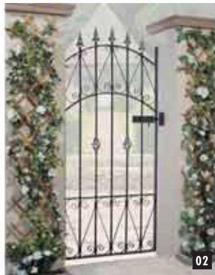
02 Winchester Tall Single