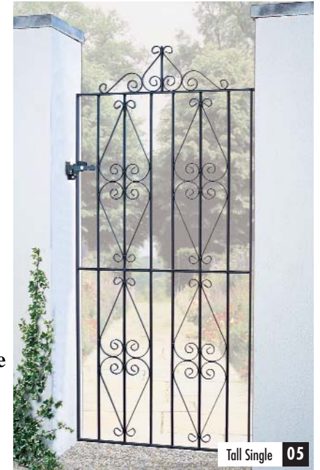
05 Watling Tall Single