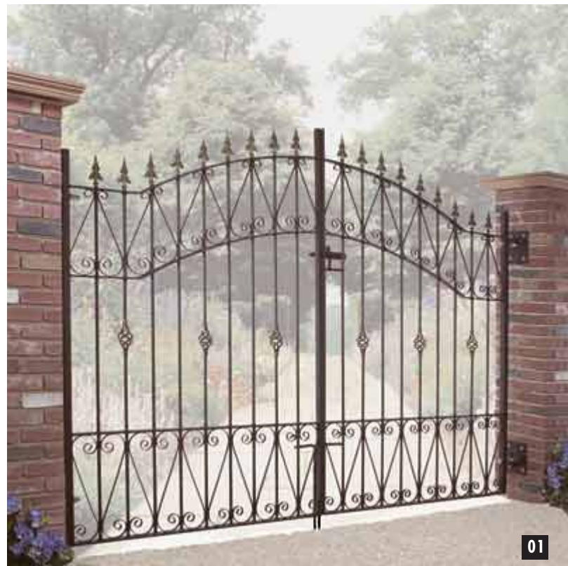
01 Winchester Double

Supplied with fittings pack for screw fixing to brick/timber or a range of metal posts. Panels can be fixed to metal posts using the self-tapping screws supplied with the posts. Height dimension is taken to the highest point.