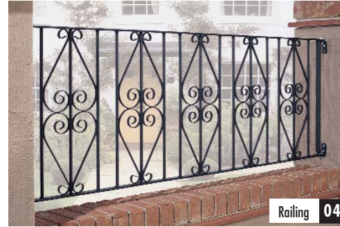
04 Watling Railing