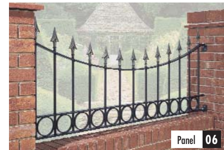
06 Fortress Panel