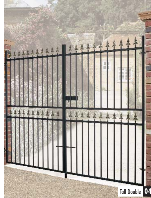
Tall Double 04