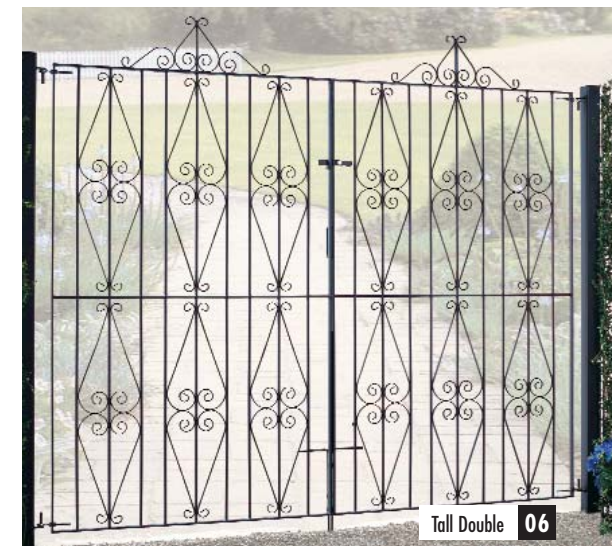
06 Watling Tall Double