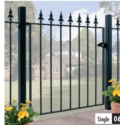
06 Roman Single