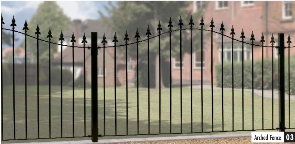
03 Roman Arched Fence