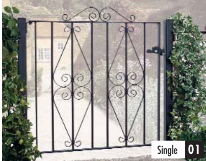
01 Watling Single

Infill bars 12mm dia, Scrollwork 12mm x 3mm