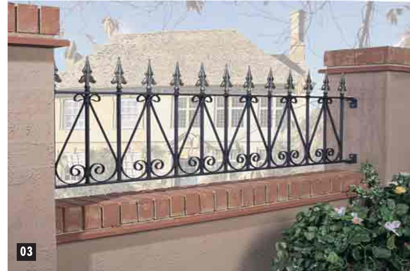
03 Winchester Scrolled Railing