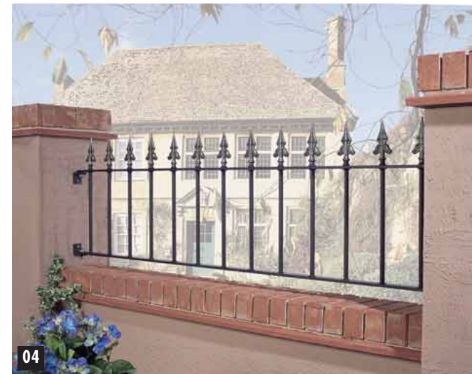
04 Winchester Railing