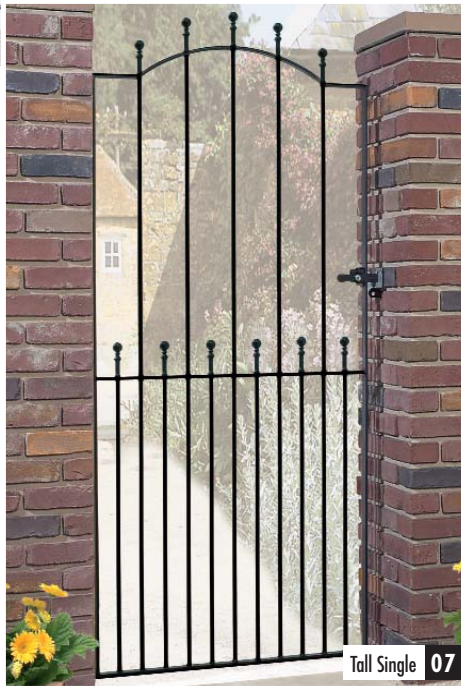
Tall Single 07