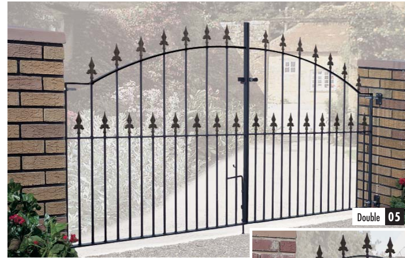
05 Roman Double