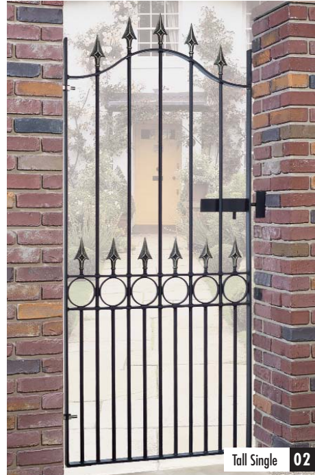
02 Fortress Tall Single