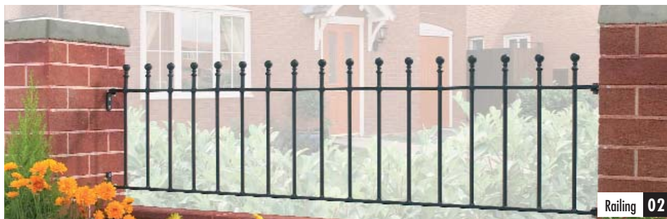
02 Viking Railing